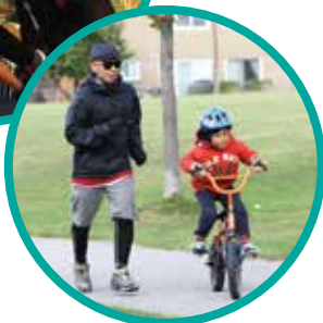
• First walkathon at 105 Gibson Centre