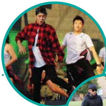
• The Open Market event